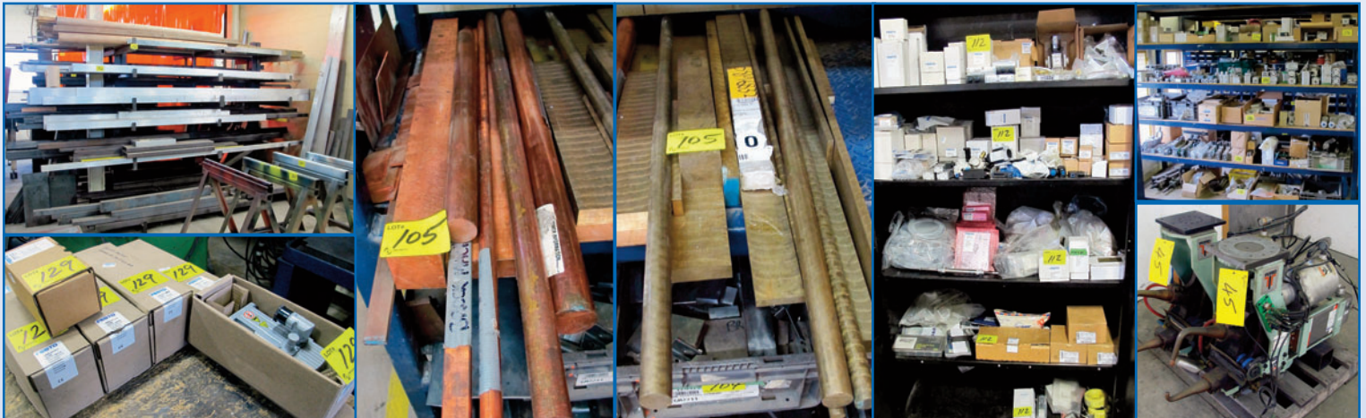
ALUMINUM/BRASS/COPPER BAR STOCK, OMRON, ALLEN-BRADLEY, FESTO, SERVO MOTORS, RELAYS, SWITCHES, CONTROL PANELS, SPOT WELDING SUPPLIES & MORE!

GARDNER-DENVER RDS125A-1 Air Dryer PLUS: Large qty of Aluminum, Steel, Brass, Copper Bar Stock, Sheet Metal, Omron, Allen-Bradley, Festo, Servo Motors, Relays, Switches, Control Panels, Transformers, Spot Welder Heads, Welding Supplies, Power and Hand Tools, Toolboxes, Chainfalls, Precision Instruments, Electrical, Wire, Office Furniture and Much More!