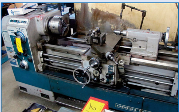
HOWA SANGYO 1000 ENGINE LATHE

Visit infinityassets.com for complete specs and additional photos