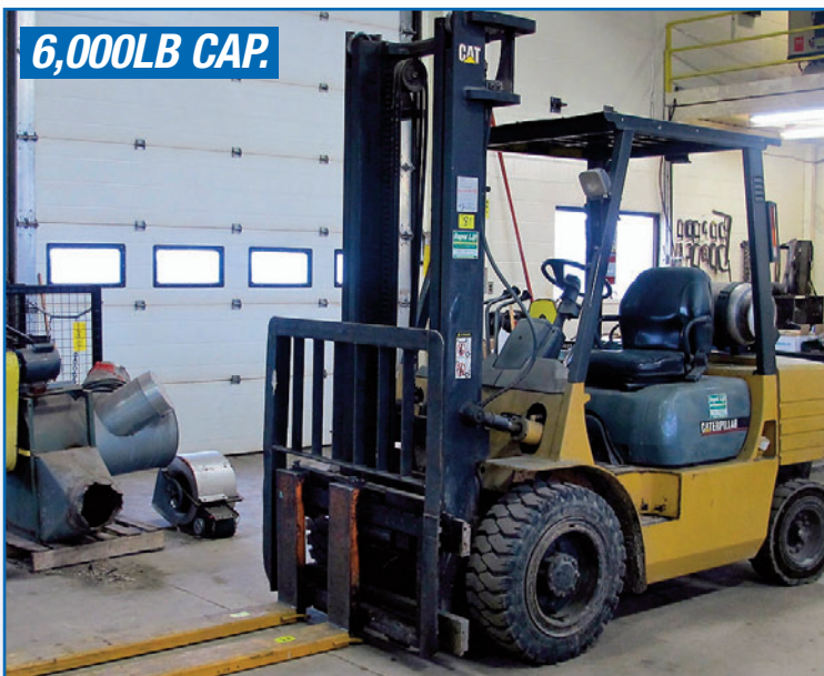
CATERPILLAR GP30 PROPANE FORKLIFT

2014 ELECTRO-AIR MPRS1000 Portable Fume Extractor, s/n SC63168 CATERPILLAR GP30 Propane Forklift, 6,000lb Cap., s/n 7AM01675, 146" Max Lift, 2-Stage Mast, Side Shift, Outdoor Tires CHAMPION 15HP Air Compressor 5HP Air Compressor