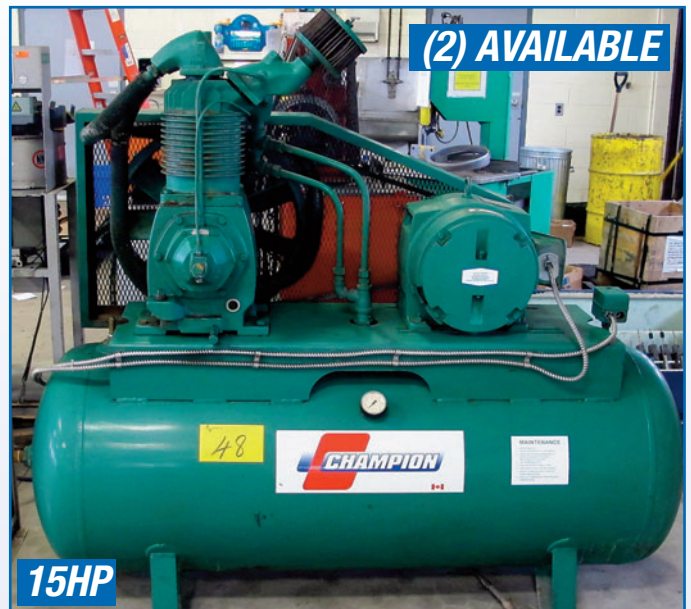
CHAMPION AIR COMPRESSOR

2014 ELECTRO-AIR MPRS1000 Portable Fume Extractor, s/n SC63168 CATERPILLAR GP30 Propane Forklift, 6,000lb Cap., s/n 7AM01675, 146" Max Lift, 2-Stage Mast, Side Shift, Outdoor Tires CHAMPION 15HP Air Compressor 5HP Air Compressor